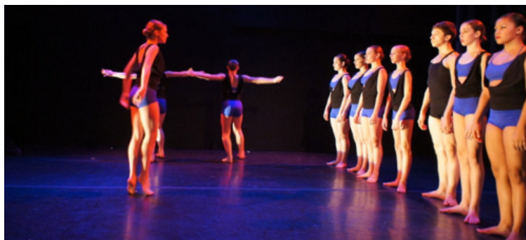
Extensions Dance Company in "Rain."